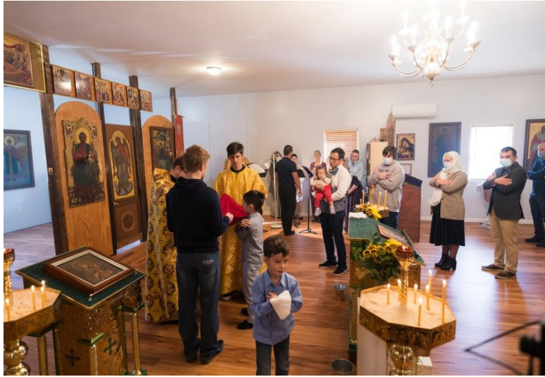
Holy Trinity Orthodox Church, Mebane, NC (November, 2020)